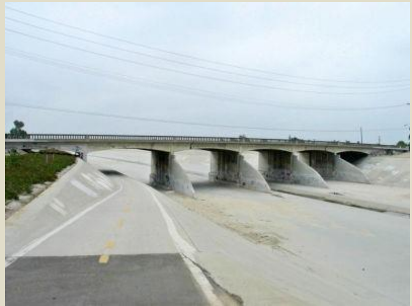
Santa Ana River Trail