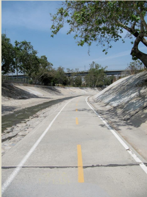
Arroyo Seco Bike Path